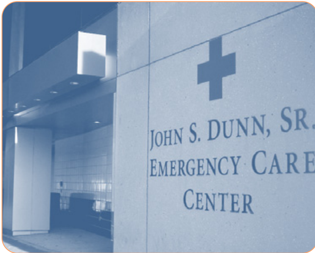
In June 2003 the new Emergency Care Center opened.